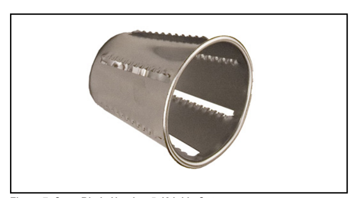
Figure 7. Cone Blade Number 5, Krinkle Cut.