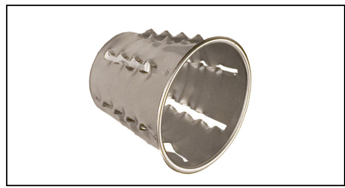
Figure 5. Cone Blade Number 3, French Fry Cut.