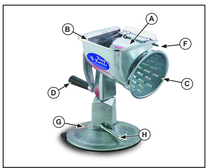
Figure 2. Features and Controls Suction Base.