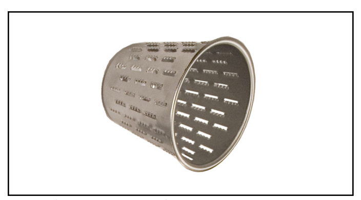
Figure 3. Cone Blade Number 1, Shredder.