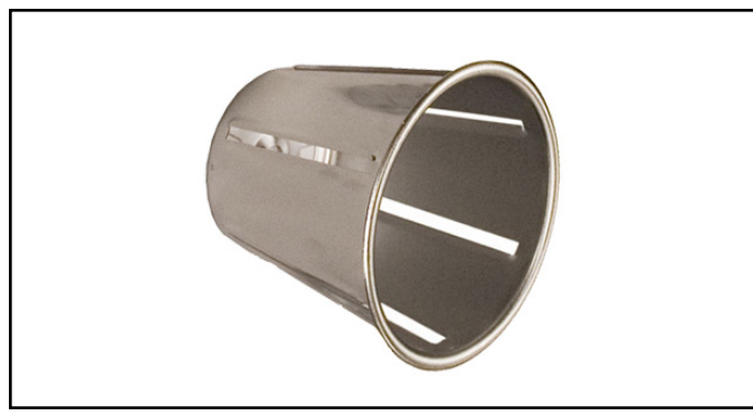
Figure 6. Cone Blade Number 4, Thin Slice.