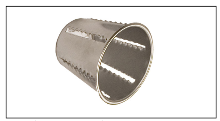
Figure 4. Cone Blade Number 2, String.