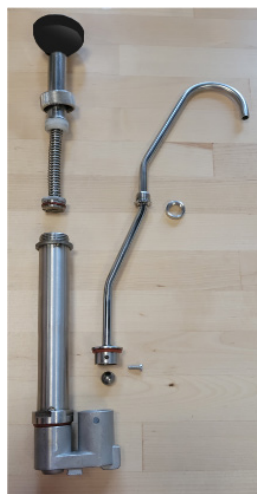
Pump Discharge Tube Unassembled & Plunger Assembly Removed from Cylinder