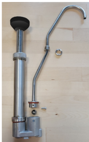
Pump Discharge Tube Assembled