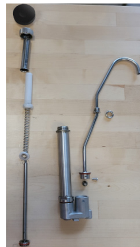
Pump Discharge Tube Unassembled & Plunger Assembly Fully Unassembled