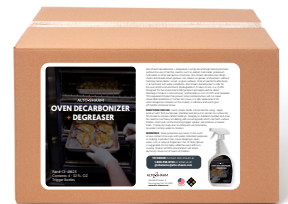
Oven Decarbonizer + Degreaser