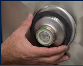
1. Add Rubber Washer