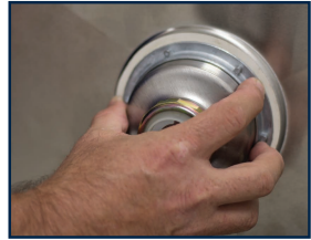
3. Screw on Die Cast Nut and Tighten