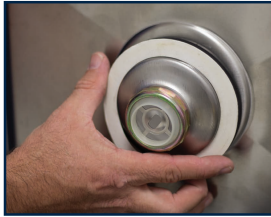
2. Add Fiber Washer