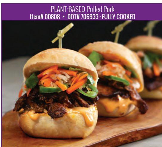
PLANT-BASED Pulled Pork Item# 00808 • DOT# 706933 - FULLY COOKED

INGREDIENTS: Water, Structured Vegetable Protein (Soy Flour, Isolated Soy Protein, Tapioca Starch), Brown Sugar, White Distilled Vinegar, Expeller Pressed Canola Oil, Tomato Paste, Sea Salt, Yeast Extract (Yeast Extract, Natural Flavoring, Salt), Dried Garlic, Dried Onion, Caramel Color, Natural Liquid Smoke Flavor, Xanthan Gum, Chipotle Chili Powder, Ground Cloves.