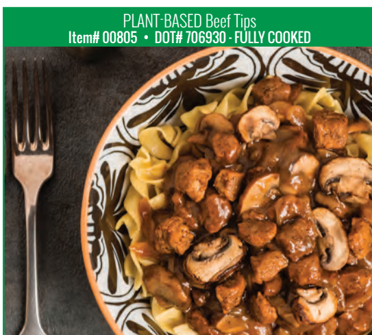
PLANT-BASED Beef Tips Item# 00805 • DOT# 706930 - FULLY COOKED

INGREDIENTS: Water, Soy Flour, Expeller Pressed Canola Oil, Yeast Extract (Yeast Extract, Salt), Caramel Color, White Distilled Vinegar, Sea Salt, Spice Flavoring (Yeast Extract, Onion, Garlic, Green Cabbage, Mushroom, Black Pepper, Ginger), Xanthan Gum.