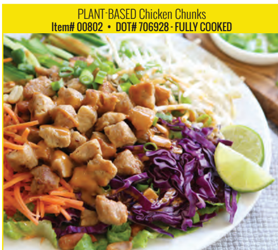
PLANT-BASED Chicken Chunks Item# 00802 • DOT# 706928 - FULLY COOKED

INGREDIENTS: Water, Soy Flour, Expeller Pressed Canola Oil, Yeast Extract (Yeast Extract, Salt), White Distilled Vinegar, Sea Salt, Dried Onion, Xanthan Gum, Dried Garlic.