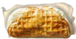
INDIVIDUALLY WRAPPED NORDIC WAFFLES