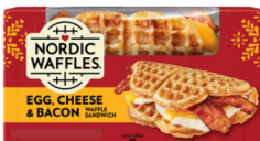
NORDIC WAFFLES BOXES