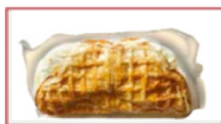
36 INDIVIDUALLY PACKAGED NORDIC WAFFLES