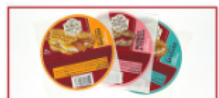
36 NORDIC WAFFLE LABELS